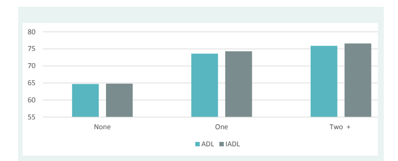
Figure 3: Percentage of older people aged 70+ receiving support from outside the household in last 4 weeks by reported difficulty with activities of daily living before the Covid-19 pandemic

We found a clear association between difficulties in performing activities of daily living and receipt of support. Respondents who reported difficulties in performing two or more ADLs or IADLs prior to the pandemic were much more likely to receive help than those with no such difficulties (Figure 3).